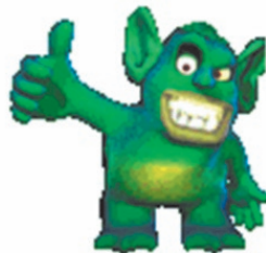
Figure C: You can opt to have your character's speech displayed as text in addition to the audio component.

Right Seat Software, Inc. 303/278-2244 www.voxproxy.com